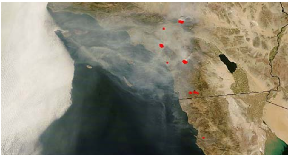
Figure 2 Less dense but more widespread smoke after days of air movement

Terrain affects weather, as well as fire and smoke behavior, in several ways. For example, as the sun warms mountain slopes, air is heated and moves upslope, bringing smoke and fire with it. After sunlight passes from a slope, the terrain cools and the air begins to descend. This creates a down-slope airflow that can alter the smoke dispersal pattern seen during the day.