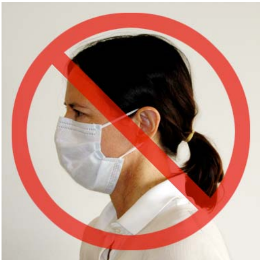
Figure 6 A surgical mask, which is designed to capture infectious particles generated by the wearer, is not a respirator and would provide little or no protection from smoke particles.