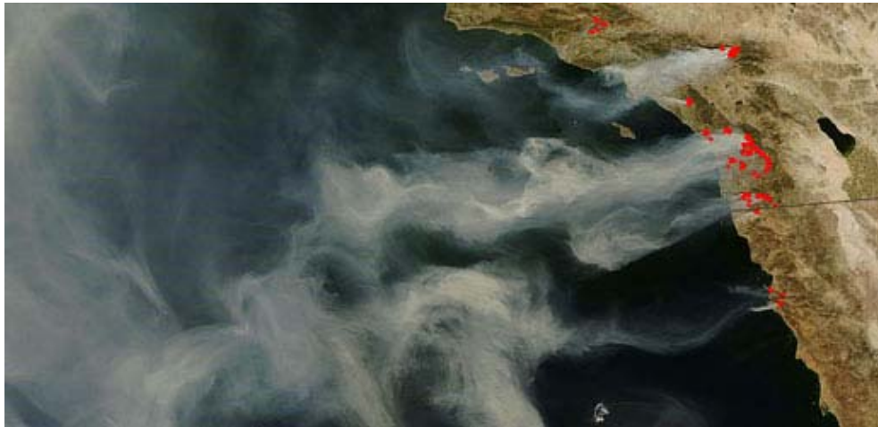
Figure 1 Discrete smoke plumes early in fire's evolution