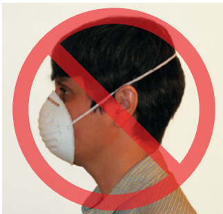
A one-strap paper mask will NOT protect your lungs from wildfire smoke.